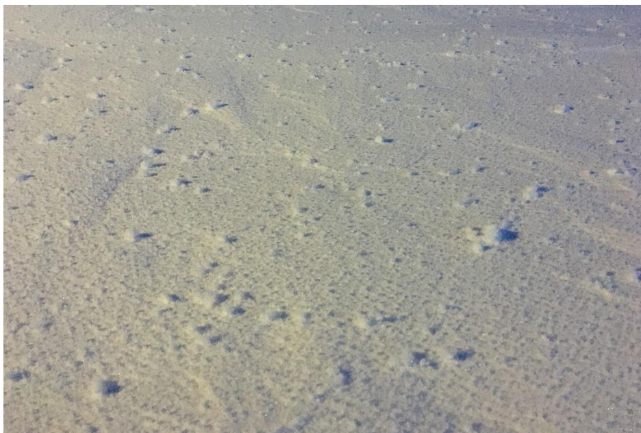
Above: 2020-01-01 Our first significant yukimarimo event!