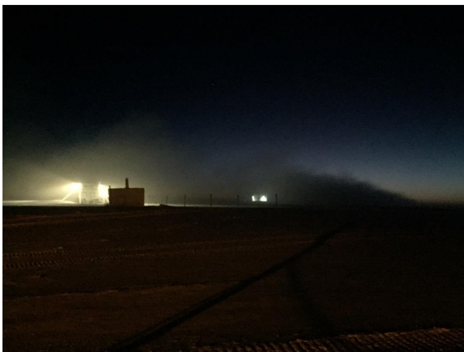
Above: 2020-01-02 1125Z: SMG exhaust plume smothers MSF (center). Wind direction approximately 320 degrees.