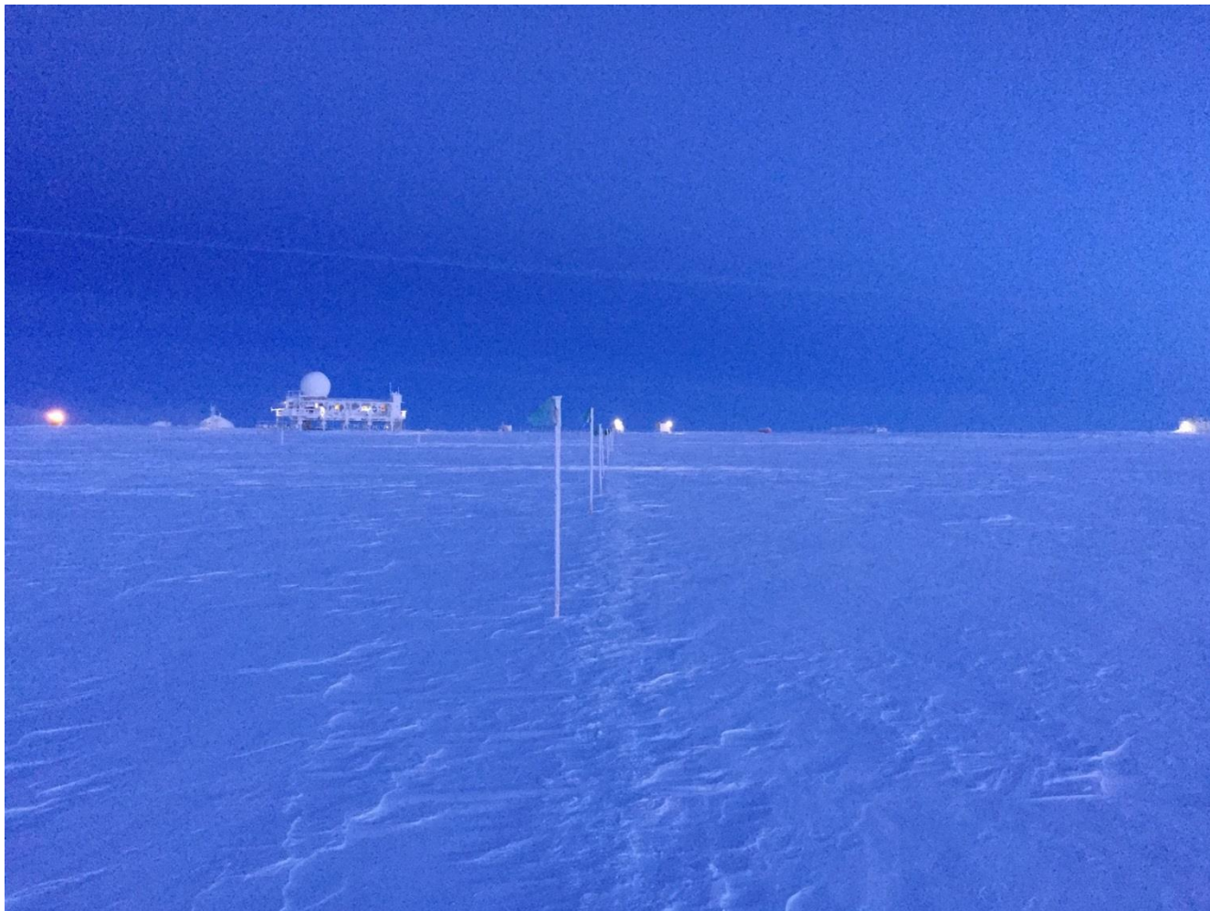
Above: 2020-01-15 1350Z: View of Summit Station from the South while walking back from TAWO.