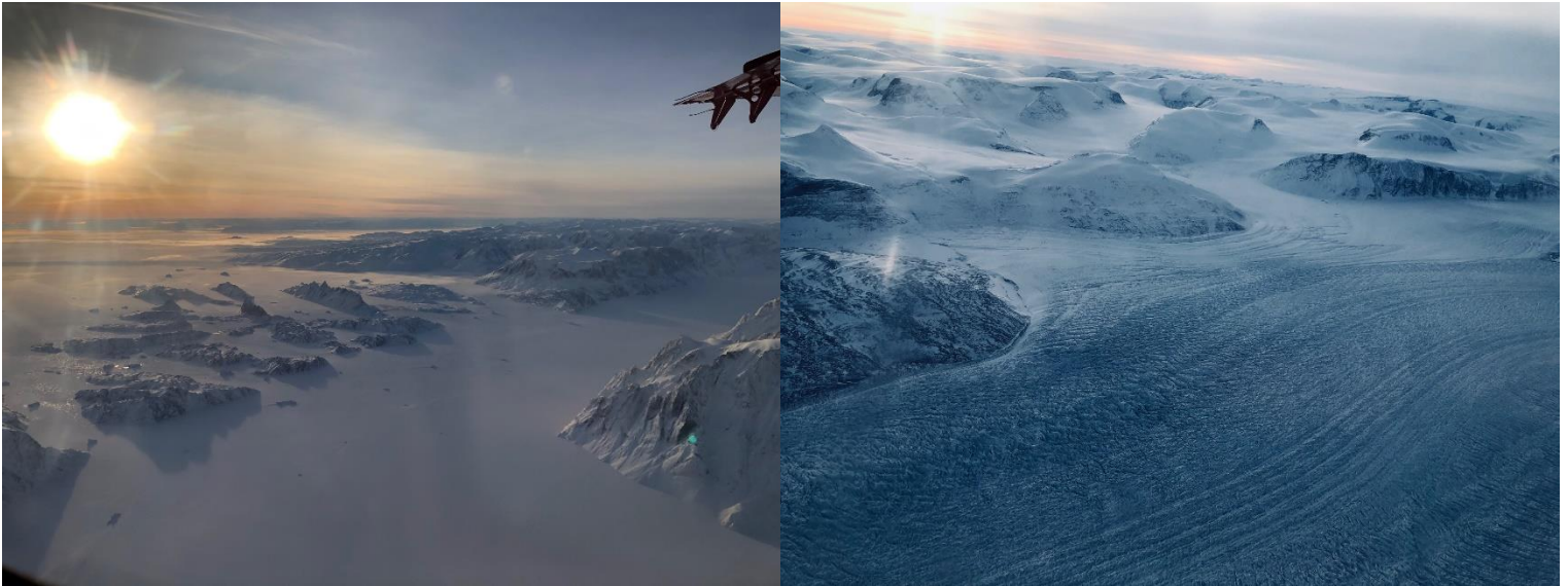
East Greenland icescapes.