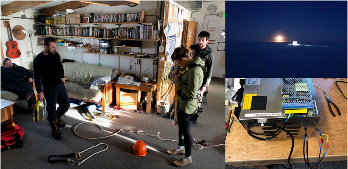
CW from left: Spring crew reviews tower rescue gear in preparation for work on the fluxtower in the coming week. full moon rising behind the MSF; and CPC rewired with external power supply.