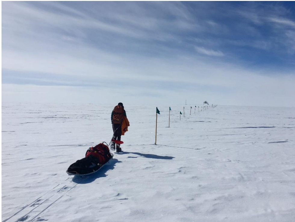
Mara hauling tower equipment out to TAWO on June 26.