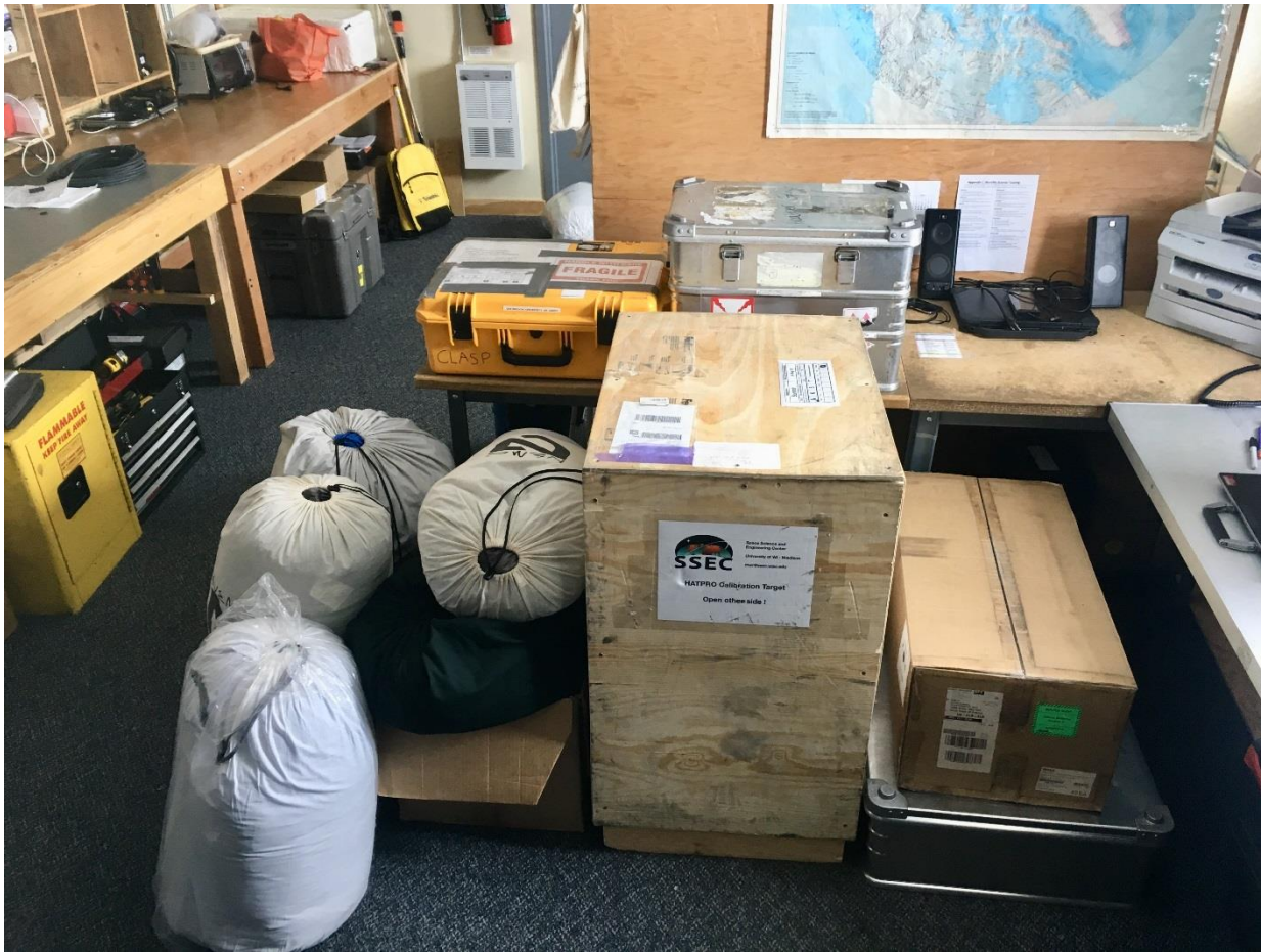
Some of the southbound cargo staged at the MSF.