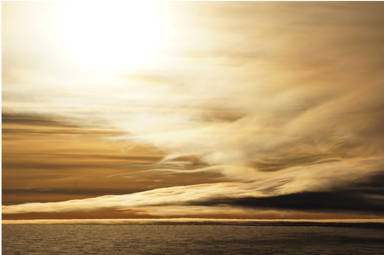
Downward propagating clouds with the Sun low in the sky on 2020-07-22.