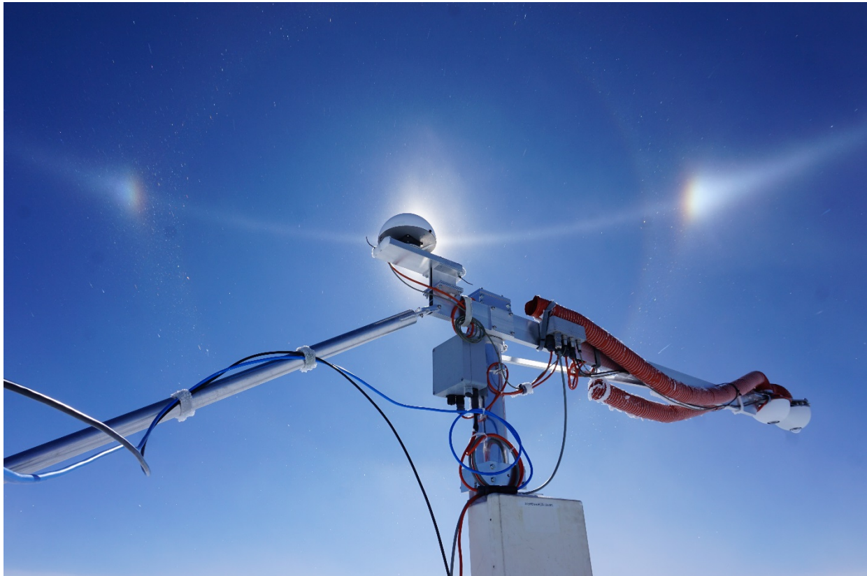
Parhelic circle on 2020-07-31 framed behind the recently raised albedo stand.