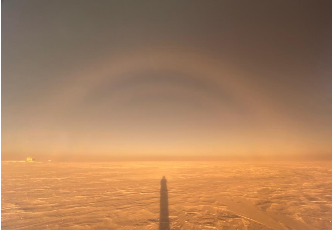
Double fog bow shot through polarized lens 2020-08-17 2220z. MSF on lower left.