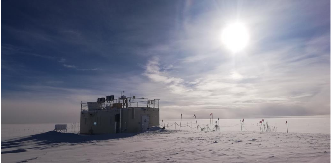
Mixed clouds create nice lighting above the MSF, 2020-09-17