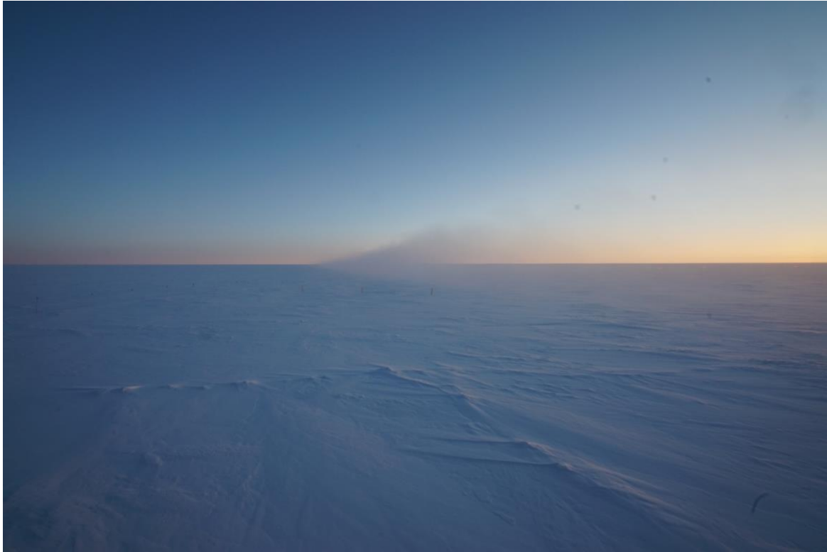
Localized fog event obscuring TAWO; nucleated by the generator plume during north winds, 2020-09-21