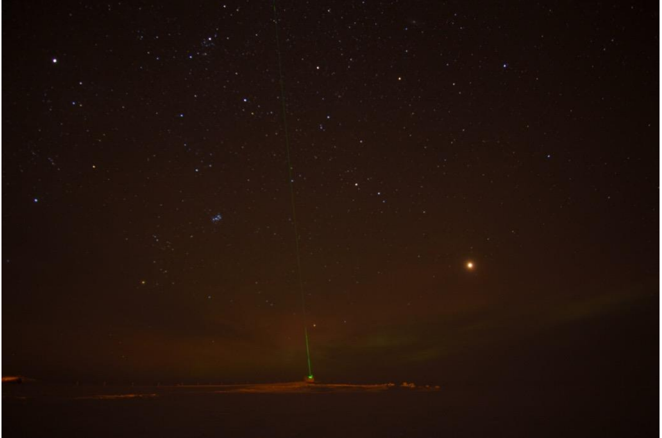
The CAPABL laser on 2020-10-15, with Mars on the right, not far from its closest approach to Earth in 15 years.