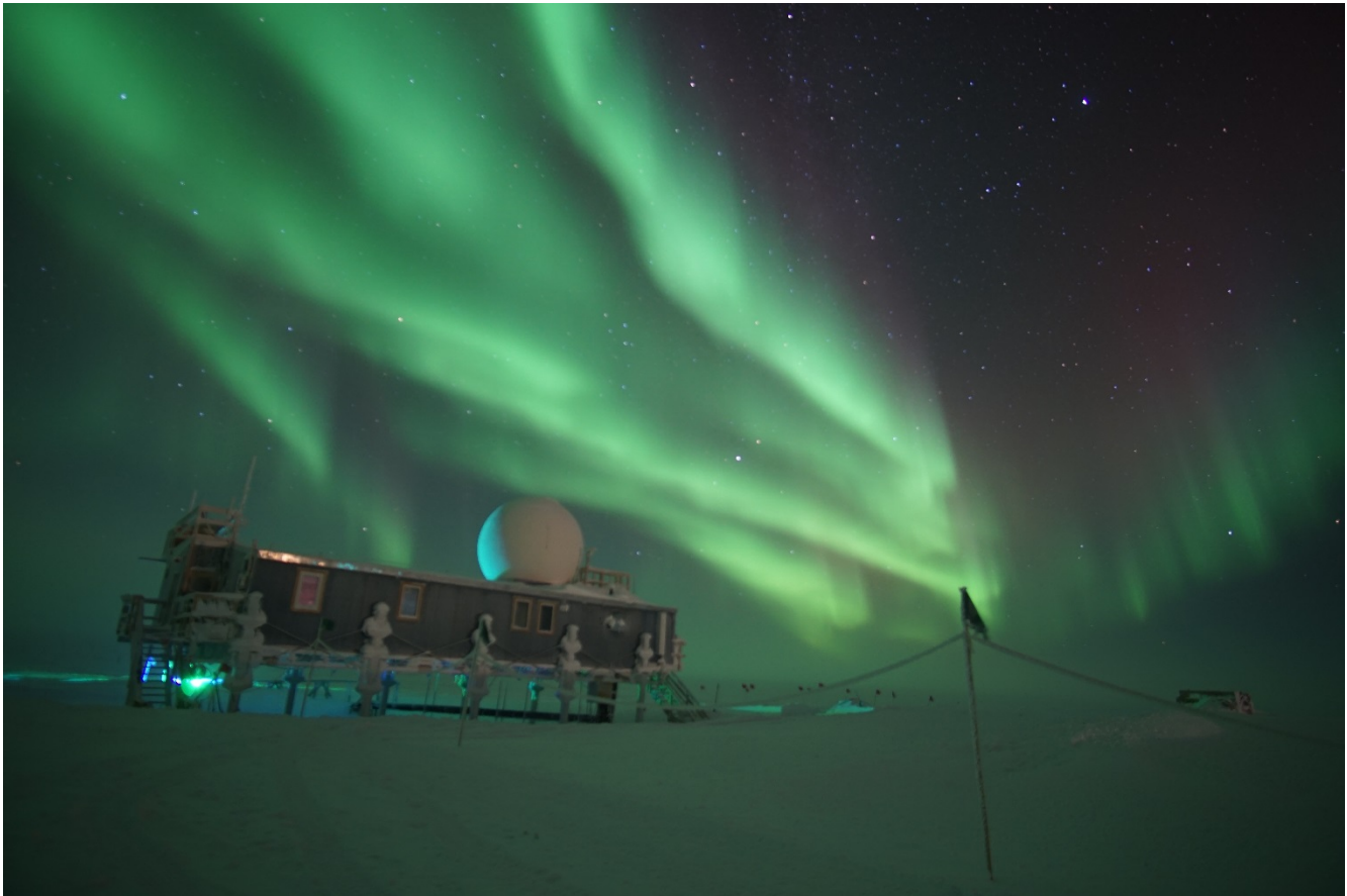
Full sky aurora show on 2020-10-23.