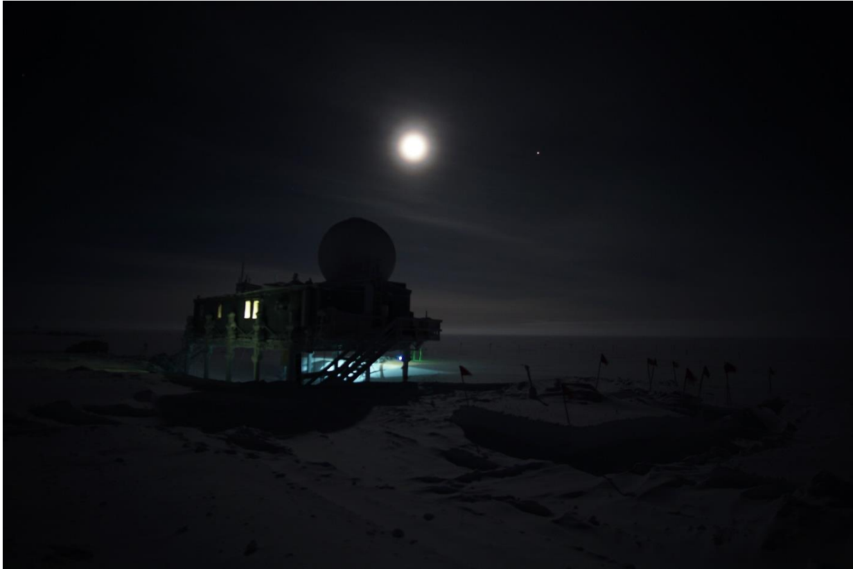
Halloween ‘blue’ moon above the big house, on 2020-10-30.