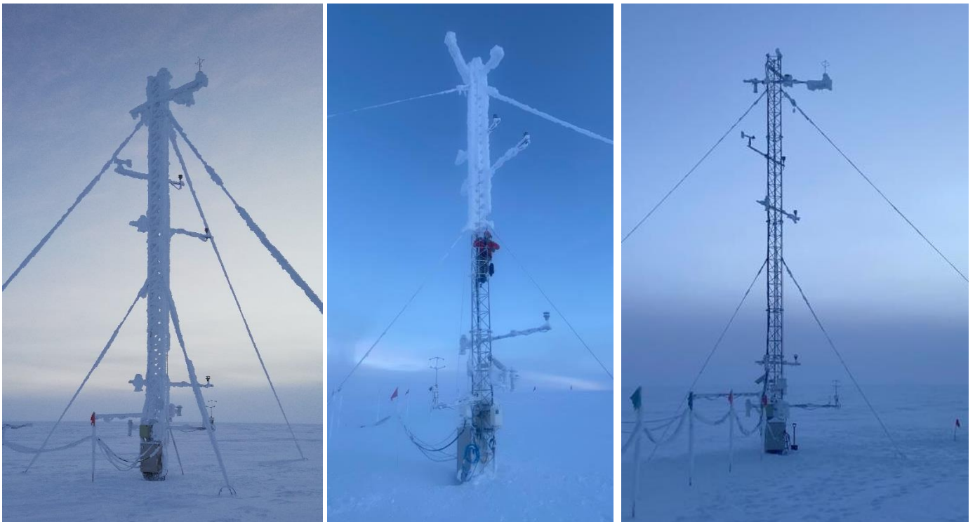
TAWO Met tower, before, during and after cleaning on 2021-01-31