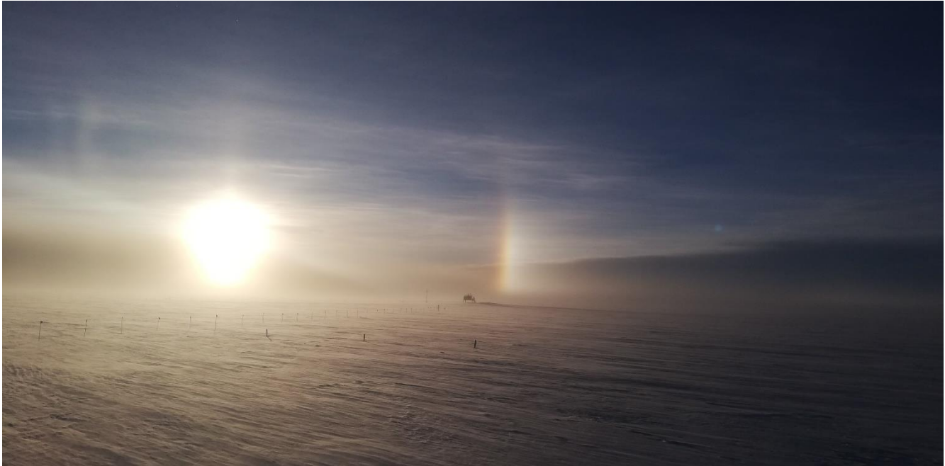
It's so nice to be able to enjoy some solar optics again: Parhelia above TAWO during a blowing snow event on 2021-02-13