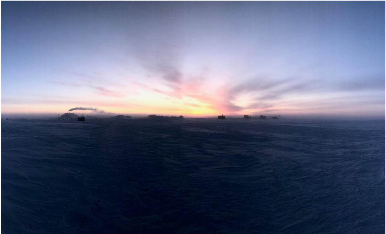
Sunrise over Summit Station 2021-04-19.