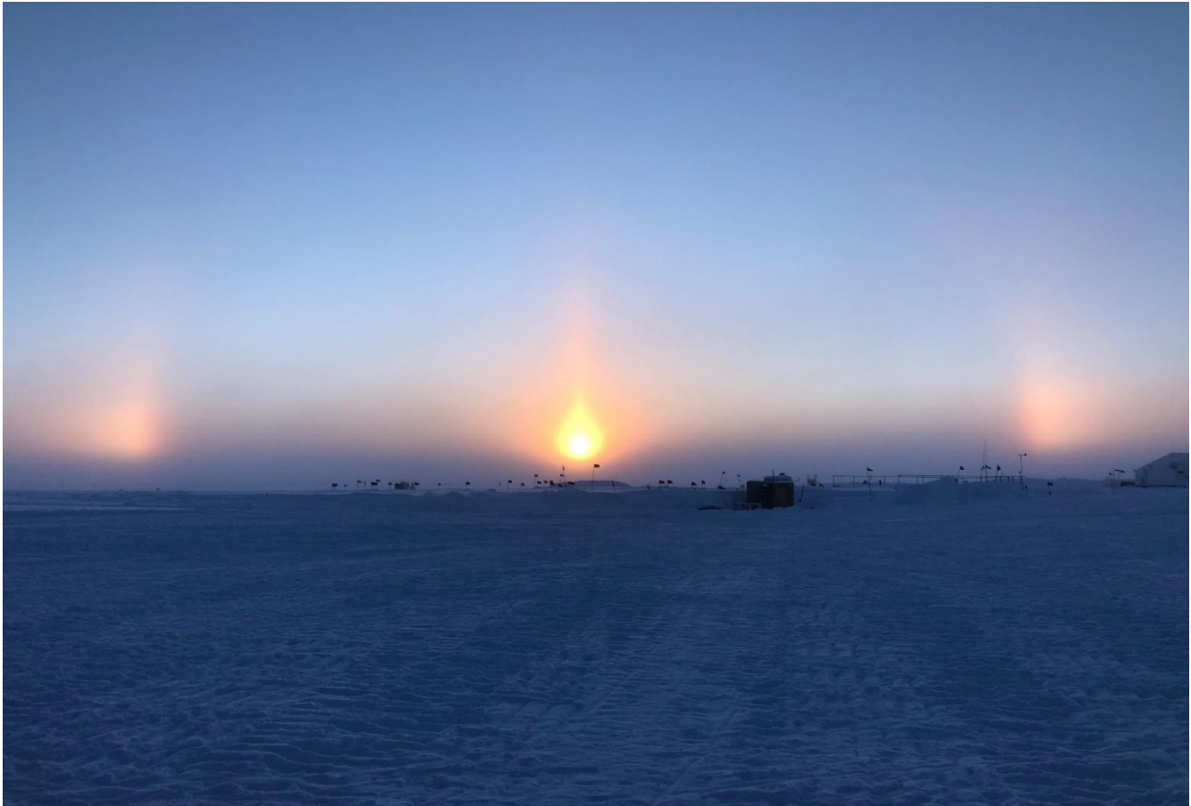
Sunset over Summit Station 2021-04-28.