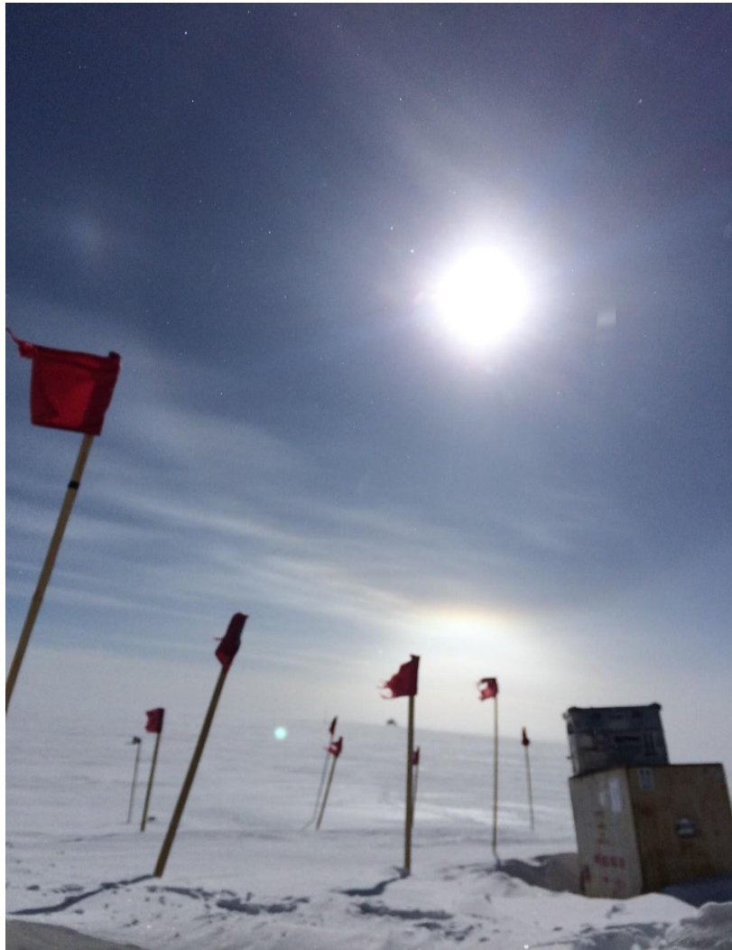
A lower tangent arc seen from outside the MSF entrance.